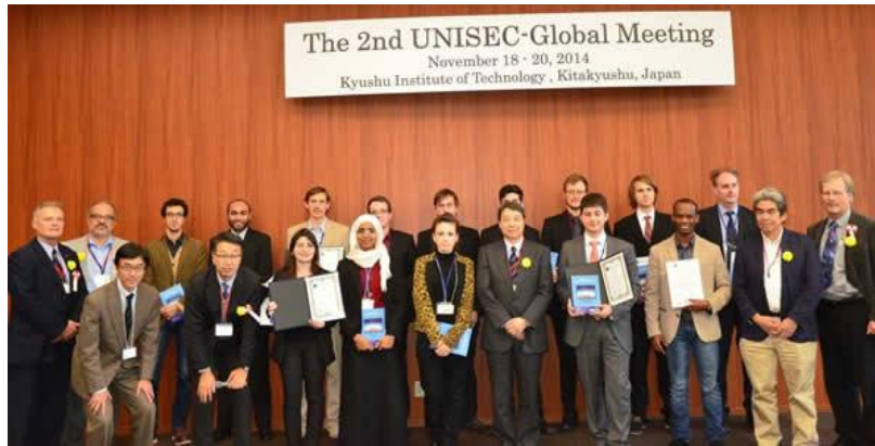
MIC3 finalists and reviewers, Nov 19, 2014, Kitakyushu, Japan