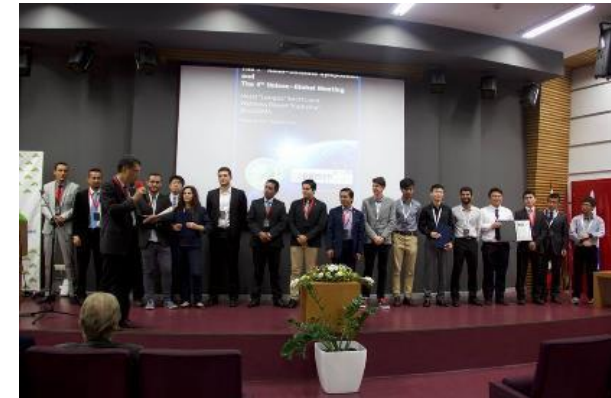
MIC4 finalists and reviewers, Oct. 21, 2016, Varna, Bulgaria