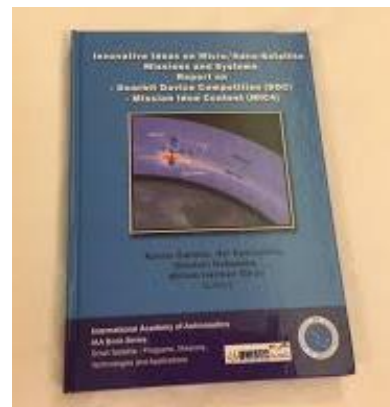
MIC4 & Deorbit Device Competition