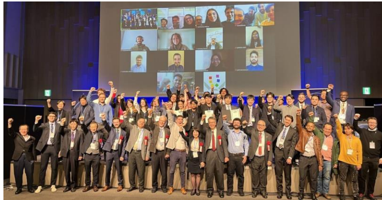
MIC8 finalists and reviewers, Nov. 29, 2023, Tokyo, Japan