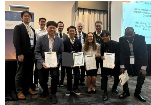
PreMIC9 finalists and reviewers, Nov. 27, 2024, Stellenbosch, South Africa