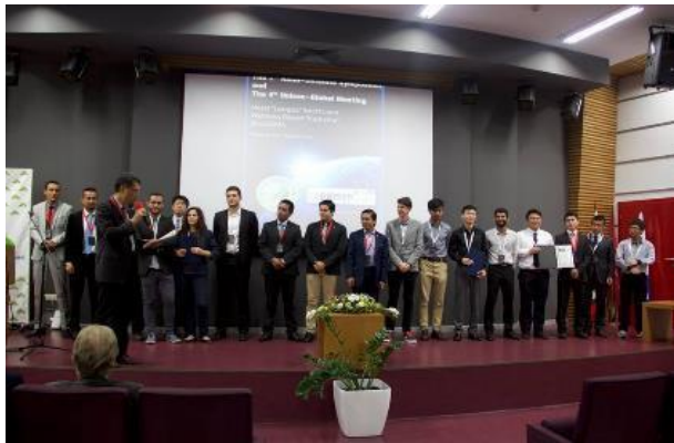
MIC4 finalists and reviewers, Oct. 21, 2016, Varna, Bulgaria